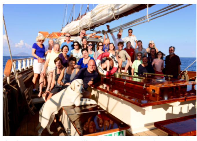
Active volcanoes, sailing fun, nature, culture and adventure are waiting for you!

There will be many factors that influence our day to day schedule. The wind that freshens up for a nice sail, the fish that is caught for the perfect evening BBQ, or we just fall in love with a quiet bay. We have allowed plenty of time to enjoy and appreciate the islands.